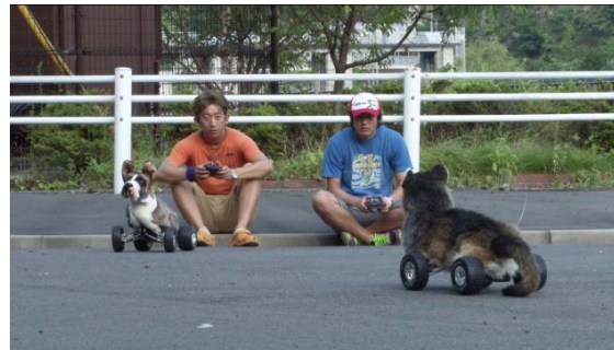
[left] THE PAST AND THE FUTURE IN THE PRESENT