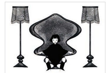
Kondoh Akino The Evening Traveling 2001-02 Animation 3 min. 56 sec. Music: Chiku Toshiaki

New York-based Kondoh Akino (b. 1980) has employed a diverse range of techniques including manga, animation, drawing, oil painting and essays to construct a highly original expressive realm. Fusing people and nature, blurring the boundaries between self and others, her imagery strikes the viewer as a dream-like blend of fact and fiction. This exhibition will present Kondoh's best-known animations - The Evening Traveling , Ladybirds' Requiem and KiyaKiya - as well as a new venture in the form of a short manga in slide-show format.