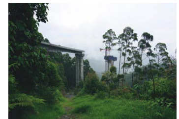
Research photograph from Colombia, 2017

Presenting Synchronicity , a brand-new video installation collaboration between globally renowned film director Apichatpong Weerasethakul (b. 1970 in Bangkok), and Hisakado Tsuyoshi (b. 1981 in Kyoto) whose artistic career has developed remarkably in recent years. Emerging from a dialogue-like process of mutual influence, the experimental work is an exciting one guaranteed to stimulate viewer imaginations.