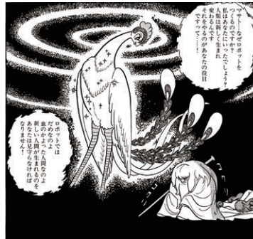
Tezuka Osamu Phoenix: Chapter of Future 1967-1968