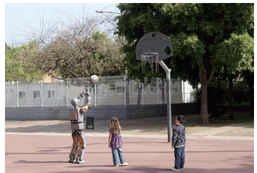
Vincent Fournier Reem B #6 [Pal], Barcelona, Spain 2010