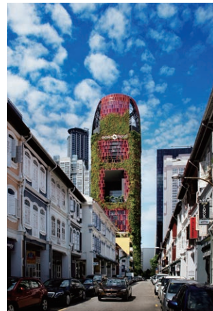
WOHA The Oasia Hotel Downtown 2016