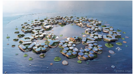
Bjarke Ingels Group Oceanix City 2019

Technical innovations are steadily altering the way we eat, dress and live. The appearance of computer modeling and 3D printing has changed the course of design history, while the development of artificial foodstuffs, for example, has emerged as one solution to global challenges such as population growth and food shortages. This section looks at the kinds of design and products emerging from the latest technologies and radical new concepts, and explores their potential to generate new lifestyles.