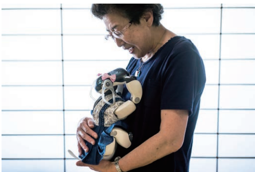
Zackary Canepari and Drea Cooper THE DOG 2015