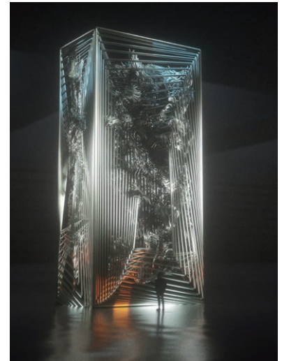
Ouchhh DATAMONOLITH 2018