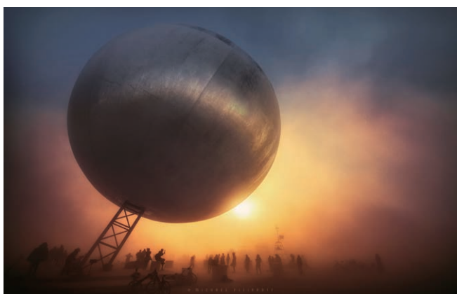
Bjarke Ingels and Jakob Lange The Orb 2018

The latest exhibition press images are available on our website for downloads: https://press.mori.art.museum/en/press-img