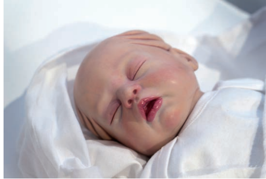
Agi Haines Thermal Epidermalplasty (from the series "Transfigurations") 2013