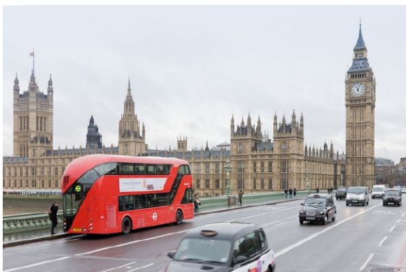
New Routemaster 2012 London