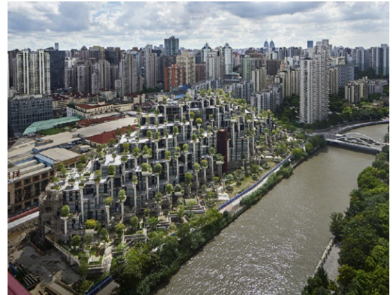
1000 Trees 2021 Shanghai

The natural world is filled with ecologies of metabolism. The energies that emerge out of them enrich and enliven the hearts and minds of people who live in urbanized environments. Heatherwick Studio approaches every project with the ambition of creating a lasting and positive impact by designing places that people will love and enjoy, providing enriching and fulfilling experiences. By exploring the function of nature within urban environments, so that trees and plants that are not merely ornamental, but incorporate the energy and spiritual well-being of the natural world into urban settings.