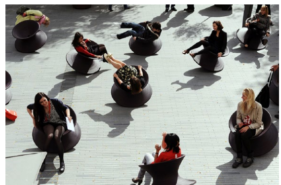
Spun 2007- Courtesy: Magis Photo: Susan Smart

The designs of Heatherwick Studio have a playful streak to them. Friction Table , the shape of which can be freely changed from a circle to an ellipse and back again, was the result of the bold idea to imbue furniture with a versatility that could respond to individual needs. Spun , a chair that could be considered as a sculptural work, rotates 360 degrees while tracing an arc when someone sits on it. This accumulation of versatile, unbridled ideas has been applied throughout the Studio's buildings on the considerably larger scale of architecture.