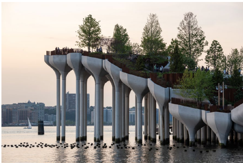
Little Island 2021 New York

“Bringing Memories to the Future;” and “Playing and Using,” the exhibition will explore what type of architecture brings with it the sort of kindness, beauty, intellectual stimulation and empathy that move the human heart.