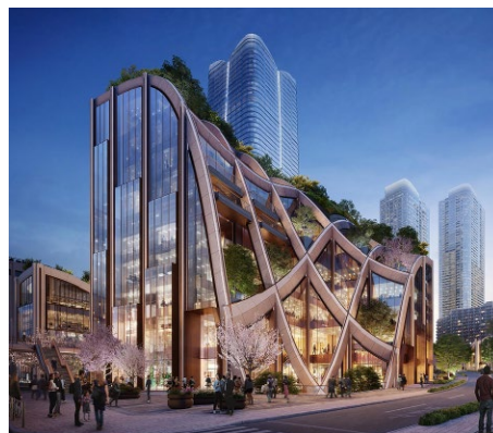
Azabudai Hills / Lower Levels 2023 (expected) Tokyo