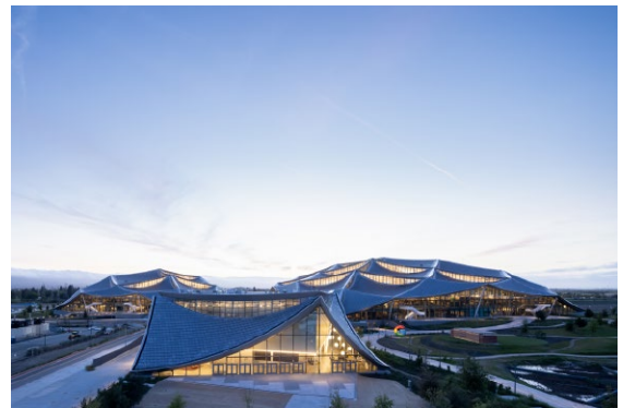
Heatherwick Studio and Bjarke Ingels Group Google Bay View 2022 Mountain View, CA

Heatherwick Studio has created many open spaces where people can come together naturally and start a conversation or dialogue. By opening up spaces that tend to become closed and cloistered, and establishing connections with adjoining spaces, the Studio takes a creative approach to the design process, crafting opportunities for togetherness, and a connection with natural light and air.