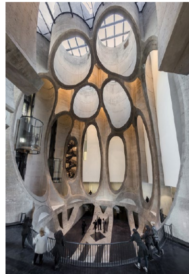
The Zeitz Museum of Contemporary Art Africa (Zeitz MoCAA) 2017 Cape Town

History is an accumulation of human stories. Buildings are also repositories of memories belonging to the people who have spent time in them. Heatherwick Studio feels that it is its mission to bring to the future the memories of buildings that have outlived their original function. Although the Studio carries out bold conversions that leverage the designs of the original buildings, one can also see a commitment throughout to repair and restore elements to their former state.