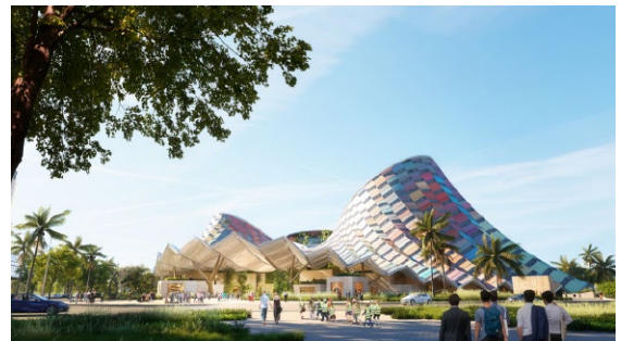
Hainan Performing Arts Center 2020 (contracted) China

One of the most distinctive characteristics of Heatherwick Studio’s designs is the attention given to three-dimensional, sculptural form. These buildings can resemble sculptures that have been conceived at a human scale, but in reality are designed to work as spatial experiences on a city scale. There is no loss of handcrafted detail or warmth in the choice of materials and texture that would be expected from an artist or artisan craftsman.