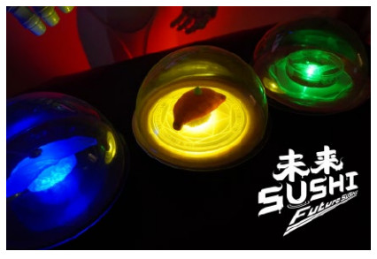
Ichihara Etsuko Future SUSHI 2022 Food sample, tableware, conveyor, electronic part, humanoid robot, 3D-printed material, acrylic, wood, and others Dimensions variable