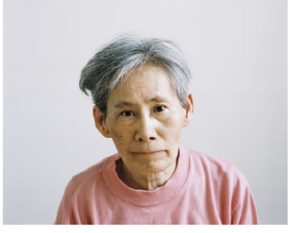
Kanagawa Shingo for a while 2011 Inkjet print 28.3 x 35.7 cm