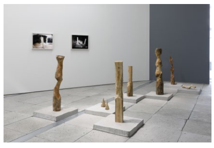
AKI INOMATA How to Carve a Sculpture 2018- Installation Dimensions variable Courtesy: Contemporary Art Foundation, Tokyo Installation view: How to Carve a Sculpture, Contemporary Art Foundation Secretariat, Tokyo, 2021 Photo: Kioku Keizo

This exhibition features the paintings of O JUN, who examines a changing world populated by different types of people; portrait photography by Kanagawa Shingo, who reunited with his then-missing aunt and subsequently documented her in photographs; and a video work by KYUN-CHOME that depicts the lives of transgender people. Amid a rapidly-growing list of initiatives with diversity and LGBTQ+ concerns in mind, this exhibition contemplates the ways in which various kinds of people live together in today's society. It also seeks to grasp people's subtle differences that lie concealed under these trending terms.