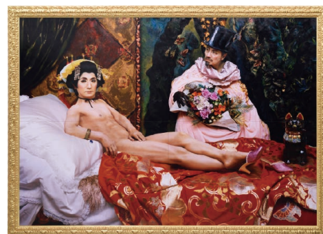
Morimura Yasumasa Une Moderne Olympia 2018 2017-2018 C-print, transparent medium 210 x 300 cm Collection: Mori Art Museum, Tokyo

Venue: Les Franciscaines, Deauville (Normandy, France)