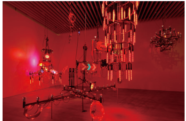
SIDE CORE / EVERYDAY HOLIDAY SQUAD rode work ver. tokyo 2018/2022 Construction light equipment, metal pipe, chain, construction wear, video, and others Dimensions variable, video: 5 min. 3 sec. Installation view: Roppongi Crossing 2022: Coming & Going, Mori Art Museum, Tokyo, 2022-2023 * Referential image

The latest exhibition press images are available on our website for downloads: