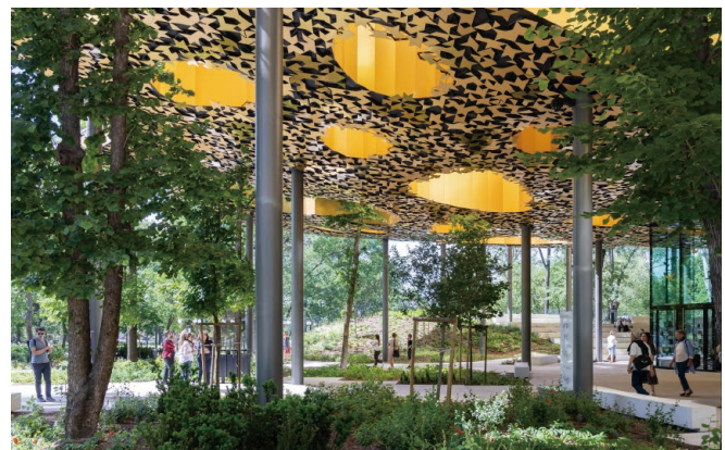
Sou Fujimoto House of Music, Hungary (exterior) [left] / (interior) [right] 2021 Budapest