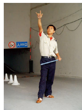
Cao Fei Hip Hop - Guangzhou 2003

This edition of MAM Collection presents works by four artists with roots in Asia—Shitamichi Motoyuki, Vandy Rattana, Zhang O and Cao Fei—featuring the anonymous people and scenes of life in the liminal spaces between nations, races, and histories. From their unique perspectives, each artist shines a light on the ever-changing history and influences between Asian countries and the United States from the early twentieth century to the present.