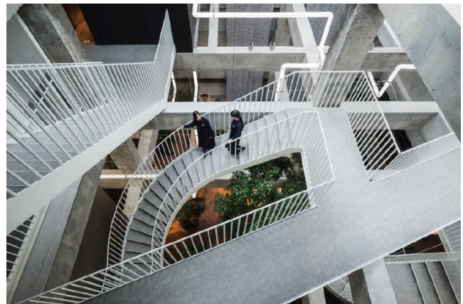
Shiroiya Hotel 2020 Gunma, Japan