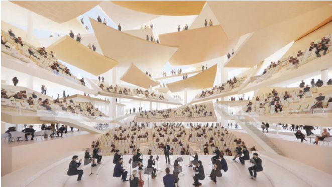
International Center Station Northern Area Complex (Sendai) Scheduled for completion in 2031 Miyagi, Japan © Sou Fujimoto Architects

Fujimoto's design for the International Center Station Northern Area Complex (Sendai) , a multi-purpose complex that will house concert halls and serve also as an earthquake memorial, was selected by competition in 2024. This exhibit displays a large 1:15 scale suspended model of the winning design that gives viewers an appreciation of its structure, together with study models and other materials that reveal how the concept of "many/one echo(es)" was given concrete form in the design process. To help provide a comprehensive understanding of Fujimoto's architecture, the exhibit is further embellished with project models reflecting his concept of "diverse and unified", together with relevant video footage of an interview with Fujimoto and concept drawings of his seventy major projects.