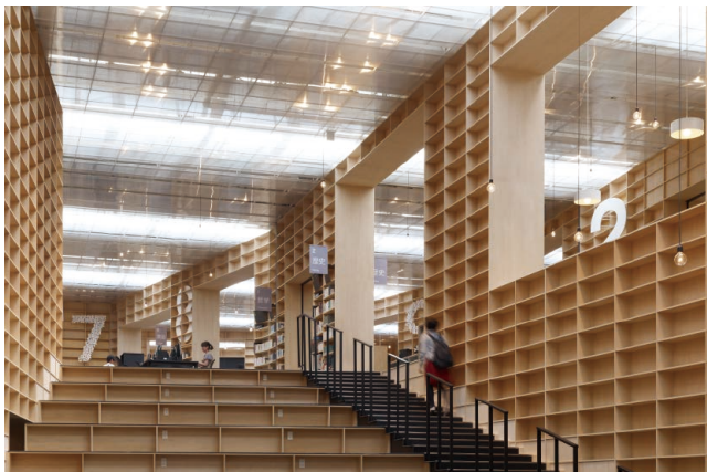
Musashino Art University Museum & Library 2010 Tokyo