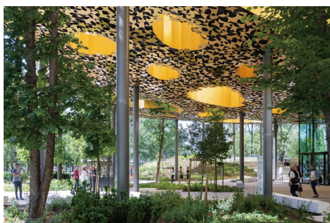
House of Music Hungary 2021 Budapest