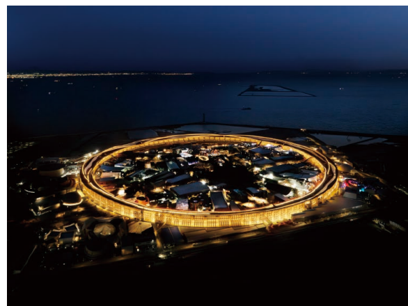
The Grand Ring for Expo 2025 Osaka, Kansai, Japan 2025