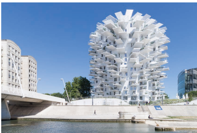
L'Arbre Blanc (The White Tree) 2019 Montpellier, France

Today, due to the continually changing relationships between people and their lives influenced by technological developments, architecture and cities are being called on to play a bigger role than before, including consideration for the environment and the function of connecting fragmented communities. We welcome visitors to join us as we take Fujimoto's practice as the context for considering how architecture could change our lives in times like these.