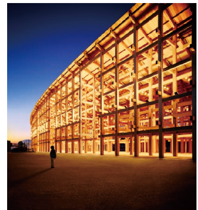
The Grand Ring for Expo 2025 Osaka, Kansai, Japan 2025

The show presents The Grand Ring project that has become the symbol of Expo 2025 Osaka, Kansai, Japan. Fujimoto is serving as Site Design Producer for the Expo. This exhibition zeros in on the Ring concept from a variety of perspectives throughout the galleries, including the 1:5 model of part of the Ring, photographic records of its exterior, project materials ranging from the Ring's original conception to its completion, and a model of the Ring included in the large the Forest of Thoughts (2025) installation.