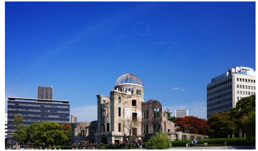
Making the Sky of Hiroshima "PIKA!" 2009

Making the Sky of Hiroshima "PIKA!" (2009) is a work that captures the moment in 2008 when the artists chartered a skywriting plane to write the word "Pika" (evoking the flash of the bomb) above the A-Bomb Dome in Hiroshima. The artists' intention was to render visually, and in comic-book style, the growing indifference to the peace on which contemporary Japanese society is founded, but when misunderstanding and speculation were added to the mix, the result was controversy. Having apologized to A-bomb survivors, their families and supporters for not giving sufficient advance notice of the stunt, Chim ↑ Pom has subsequently continued to converse and occasionally collaborate with them and the wider Hiroshima community on a number of projects. Subsequent Hiroshima-themed works include Pavilion (2013-) and Non-Burnable (2017) both featuring origami paper cranes, plus the still-burning flame from the bomb in We Don't Know God (2018).