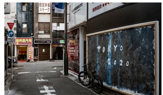
May, 2020, Tokyo (Hey-rasshai) - Drawing a Blueprint - 2020

Chim ↑ Pom installed billboards painted with cyanotype sensitizer in various locations around the capital for a project undertaken in May 2020, during Japan's COVID-19 State of Emergency. The texts "Tokyo 2020" and "Atarashii Seikatsu-Youshiki (New normal)" on these were designed to be unexposed, and left white. Incorporating sun, shadow, wind and rain, these works could be described as the open air and time, etched in blue, of streets almost deserted during the state of emergency, when people were urged to "stay at home." With deceptive simplicity, these works express the bizarre reality of Tokyo whose blueprint for a bright future was now lost.