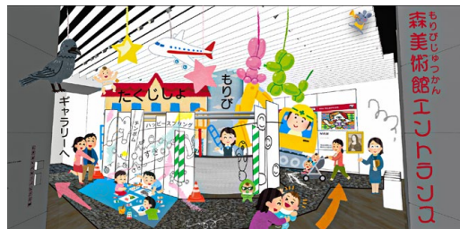
"Crying Museum" illustration/referential image

For the new art project entitled "Crying Museum" where Chim ↑ Pom opens a nursery (daycare center) at the exhibition, there is going to be a crowdfunding carried out for the purpose of raising funds for its operation. This new art project was essentially inspired by the social circumstances of Japan today where it is difficult for the child-rearing generation to casually visit museums, but how many days it can be operated in fact will depend on your support. The target amount is 4 million yen with a stretch goal set. There are six different support amounts: from 1,000 yen to 330,000 yen (tax included), and there will be various rewards. The most notable reward will be the Original Coloring Book by Chim ↑ Pom (common reward across the board). With the provided Coloring Book data, you will be able to not only color as you like, but also apply for the "Coloring Contest" scheduled as a project-related event. Aside from the members of Chim ↑ Pom, Aida Makoto, Higashimura Akiko and Kawamura Kosuke will be the judges to decide the winners.