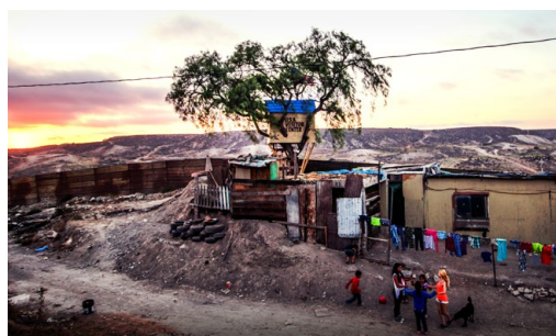
U.S.A. Visitor Center (from the project “The other side”) 2017 Giclee print 66 x 100 cm

Since 2014, Chim ↑ Pom has been engaged in “The other side” series dealing with the problem of America’s southern border. The title is taken from the name commonly used for the US by those living on the Mexican side. The Chim ↑ Pom team also conceived the idea for Don’t Follow the Wind (March 11, 2015-), an international exhibition in the Fukushima exclusion zone that “no one can actually go see” until the ban on return is lifted, and has been participating as artists themselves. “Borders” is one of the themes that Chim ↑ Pom has tackled consistently throughout the years, and one perhaps even more important than ever in these pandemic days of lockdowns and restricted mobility.