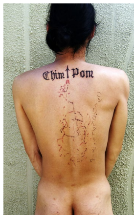
KOKKURISAN TATTOO 2008 Lambda print 83 x 52 cm

Physical expression is fundamental to Chim ↑ Pom, and has been from the collective’s early days, when they took to the streets armed with nothing more than themselves and a video camera. Advances in CG technology mean that now they could probably produce works without actually using their bodies, but for the members of Chim ↑ Pom, the body itself remains central to artistic expression, even if that means tattooing their flesh, fasting, or repeated vomiting. It is this very realness that has the power to astound.