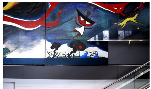
LEVEL 7 feat. "Myth of Tomorrow" 2011

In the immediate wake of 2011's devastating Great East Japan Earthquake, Chim ↑ Pom undertook a number of projects related to the quake, tsunami, and subsequent nuclear power plant accident. Starting with Never Give Up (2011), this period saw the emergence of some of their best-known works such as REAL TIMES (2011) and KI-AI 100 (2011), while in LEVEL 7 feat. "Myth of Tomorrow" (2011) they added, guerilla-fashion, a picture showing the accident at the Fukushima Daiichi Power Plant, in a blank space at the lower right of Okamoto Taro's Myth of Tomorrow mural in Shibuya Station. An ongoing project in the quake exclusion zone, among other quake-related ventures, indicates that a decade on the disaster remains an important theme for Chim ↑ Pom.