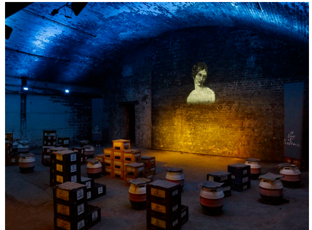
"A Drunk Pandemic" 2019-2020

Courtesy: ANOMALY and MUJIN-TO Production, Tokyo