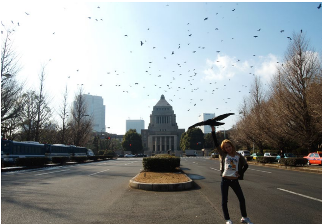
BLACK OF DEATH 2008