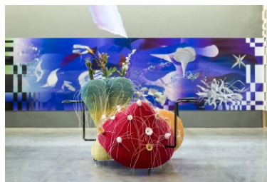
Yang Haegue Installation view: Haegue Yang: The Cone of Concern , Museum of Contemporary Art and Design (MCAD), Manila, 2020 * Referential image

Period: April 19 [Wed] - September 24 [Sun], 2023