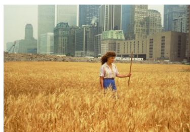
Agnes Denes Wheatfield - A Confrontation: Battery Park Landfill, Downtown Manhattan - With Agnes Denes Standing in the Field 1982

Period: October 18 [Wed], 2023 - March 31 [Sun], 2024