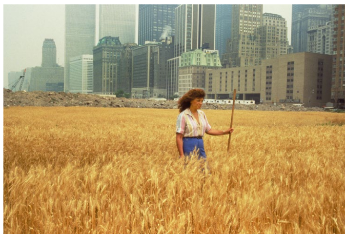
Agnes Denes Wheatfield - A Confrontation: Battery Park Landfill, Downtown Manhattan - With Agnes Denes Standing in the Field 1982

Contemplating how contemporary art and artists have engaged to date with environmental issues, and how they can do so in future, Our Ecology will aim to explore the possibilities left for the sustainable future on a global scale.